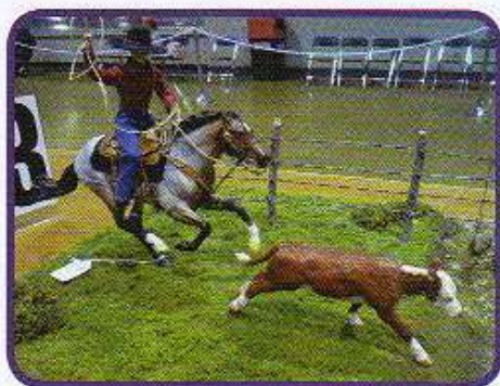
A Breyer® "Rushmore" is competing in the OF Western Stockwork class.