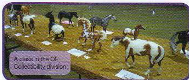
A class in the OF Collectibility division

NAN 2013 will be held in Harrisburg, PA, on June 21-23, and in 2014 will be held again in Lexington, KY, three days prior to the BreyerFest festivities. 🐾